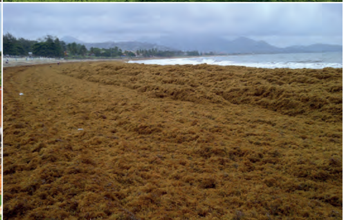
Figure 1 | Green and golden tides. A moderate Ulva green tide on a beach in Brittany, France, (top left) and the Qingdao beach, China, during a green tide (top right). Clean up of Sargassum golden tide in a bay in Antigua, southern Caribbean (bottom left) and a golden tide on a beach in Sierra Leone, Africa during the spectacular 2011 event (bottom right).