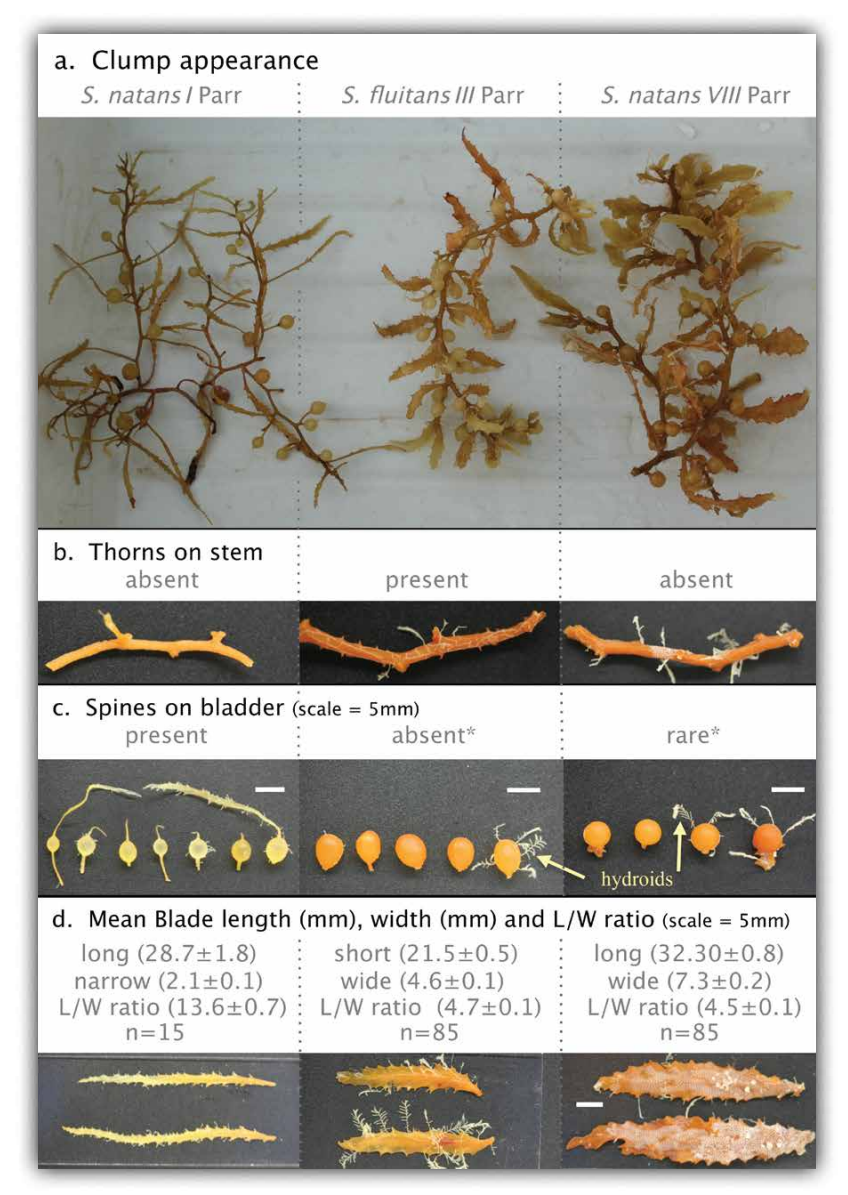
FIGURE 1. Characteristics of three pelagic Sargassum forms (left to right: S. natans I Parr, S. fluitans III Parr, and S. natans VIII Parr) collected during the 2014/2015 Caribbean inundation event. (a) Fronds showing arrangement of stem, blades, and bladders. (b) Section of stem highlighting presence/absence of thorns. Bladders and blades removed. (c) Bladders highlighting presence/absence of spines. Bladder stalk is directed downward in each photo. (d) Mean and standard error for length (mm), width (mm), and length/width ratio of blades. *Hydroid colonies are often present on Sargassum and can be mistaken for spines or thorns.

Shipboard Observations Reveal Dominance of a Previously Rare Form